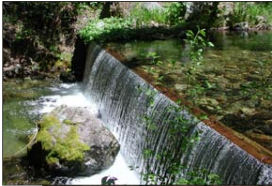
Before and after photos of White Gulch dam removal project.

Salmon River Restoration Council's mission is to restore, maintain, and protect the Salmon River ecosystems through stakeholder collaboration highlighting active community participation and the development of a sustainable economy based on ecological compatibility.